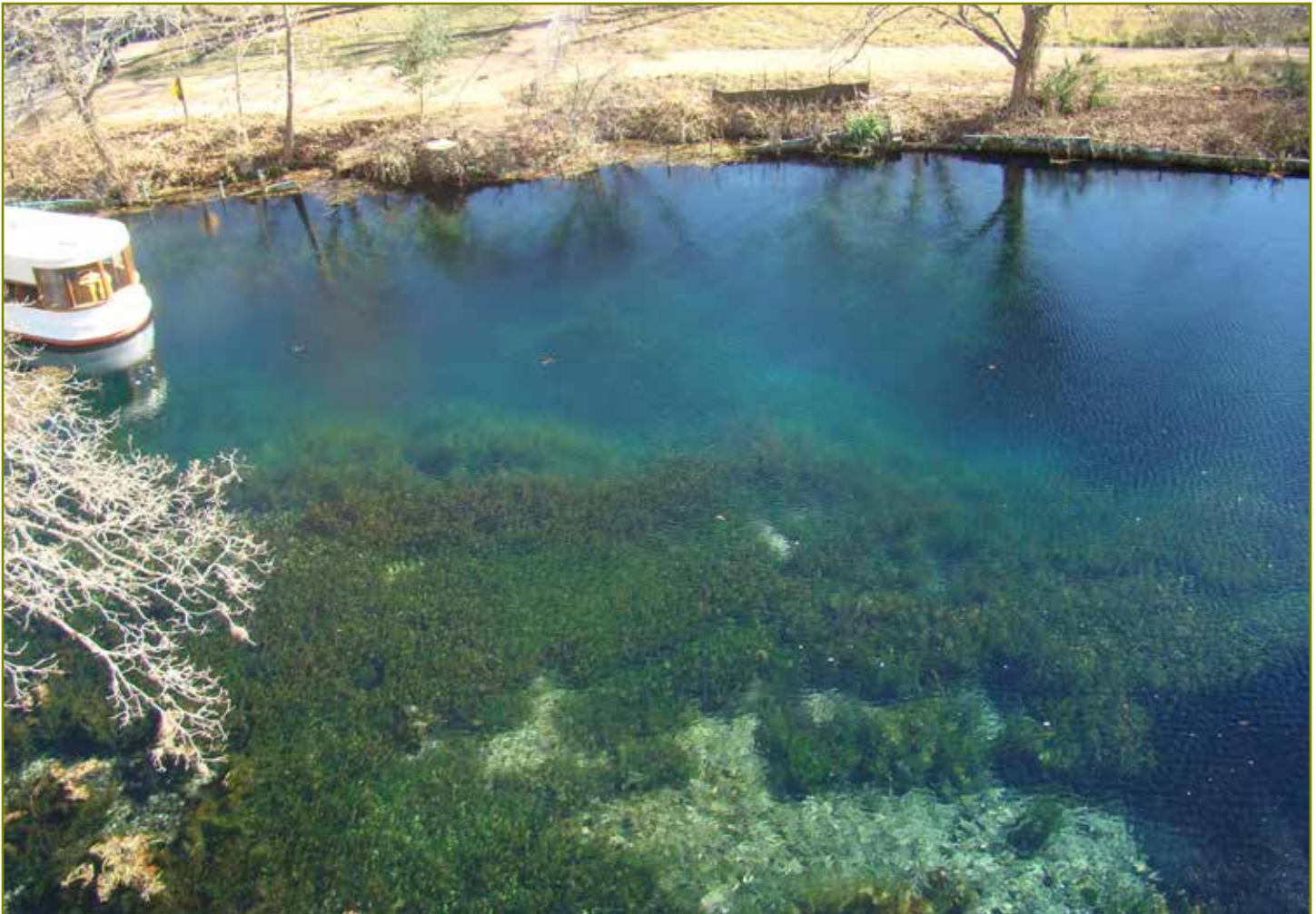
Spring Lake

agricultural, real estate development, cultural diversity, landowners and the community sit on the Core Committee. The Core Committee is supported by four subcommittees that address specific areas of stakeholder interest, including Economic Development and Water Quality and Quantity; Parks and Agriculture; Culture and Education/ Outreach; and, Data, Information and Technical Review. Additional information and a copy of the draft watershed protection plan, when available, can be found at http://smwatershedinitiative.org .