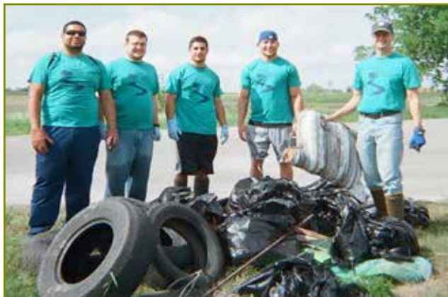
TLU Students participating in the Geronimo Creek Cleanup

The Partnership established an annual cleanup on Geronimo and Alligator creeks and the first event, held in the spring of 2013, was a huge success. Over 100 volunteers removed almost 3,000 pounds of trash and debris from the creek and drainage system that drain