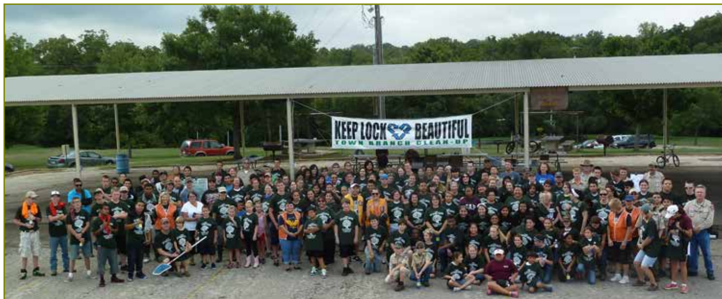
Keep Lockhart Beautiful Town Branch Clean Up

Coordination of outreach and education efforts by the PCWC facilitates and supports public participation by private individuals and local officials in the implementation of the Plum Creek WPP. The watershed coordinator develops publications, such as a semi-annual newsletter, factsheets, website and social media content, that promote and communicate watershed pollution prevention efforts. Additionally, the PCWC coordinates and conducts outreach and education efforts across the watershed, organizing training programs, such as Lone Star Healthy Streams (agricultural component); conventional OSSF maintenance workshop for homeowners; aerobic system operation and maintenance workshops for homeowners; and a Nonpoint Source Education for Municipal Officials workshop.