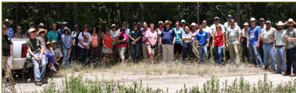
Riparian Workshop - Photo by Nick Dornak

interactive learning opportunities for riparian education across the state; and, 4) establish a larger, more well-informed citizen base working to improve and protect local riparian and stream ecosystems.