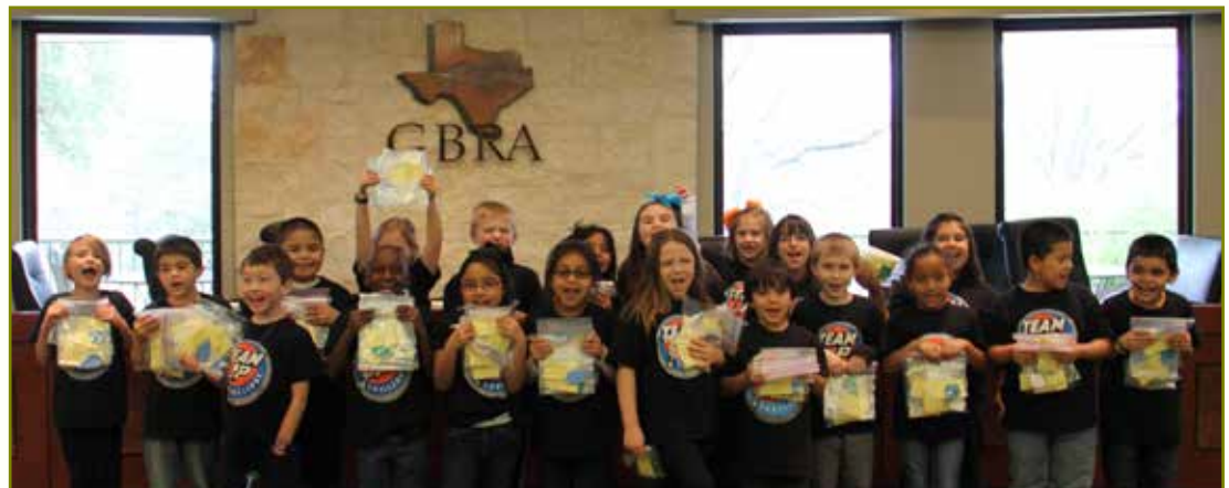
Rodriguez Elementary School

Public education efforts are ongoing in the Upper Guadalupe Basin as well. UGRA has an active education program designed to give Kerr County residents a better understanding of the Upper Guadalupe River and its watershed. UGRA staff prepares presentations for area schools, clubs, organizations and summer camps to teach about water quality, conservation, the water cycle, and the importance of the Guadalupe River to the community. UGRA publishes a monthly column in the local newspapers about water quality and the aquatic environment and has an active public awareness campaign to keep the community informed on water issues. Above all, UGRA is a resource and advocate for the community on water quality, surface water, and the Guadalupe River. Please contact UGRA with comments, questions or concerns at (830) 896-5445 or www.ugra.org .