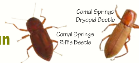
Comal Springs Dryopid Beetle