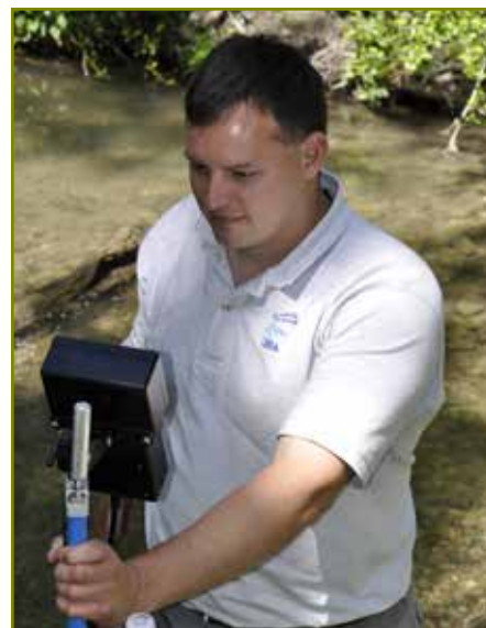
Measuring flows in the Geronimo Creek

The TCEQ has begun to develop numeric water quality standards for nitrate-nitrogen. At the end of that process, the standards established by TCEQ and the EPA could move Plum Creek and Geronimo Creek from a designation of "concern for nutrients" to the 303(d) List of impaired waterbodies due to elevated nutrients. The Plum Creek and Geronimo Creek Watershed Partnerships have not waited for "impaired waterbody" status to start working on best management practices that could reduce sources of nitrates. In order to help direct efforts and funding toward the most likely or most influential source(s) of nitrate, this project will look to isotopic signatures of nitrogen and oxygen in the nitrates. The ratios of the isotopes of nitrogen and oxygen in nitrate often are useful for determining sources of nitrates in groundwater and surface water. Isotopic ratios are expressed as the ratio of the heavier isotope to the lighter isotope relative to a standard in parts per thousand (USGS, 2011).