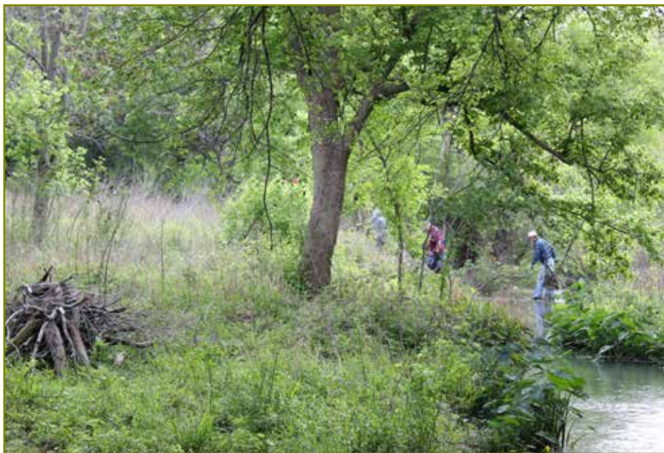
Geronimo Creek Cleanup