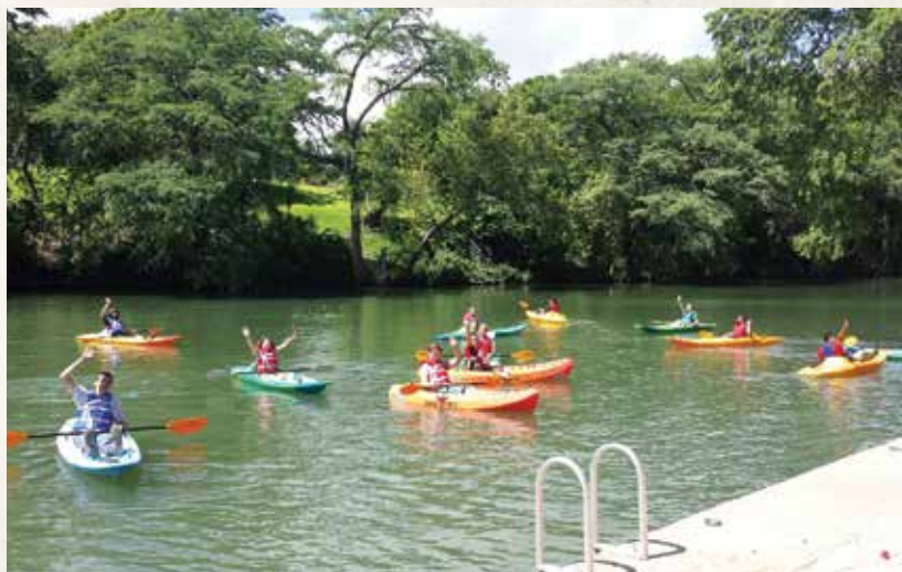
Seguin High School students celebrate after completing their Outdoor Education final exam on the Guadalupe River.

"We couldn't create this opportunity for our students without several entities in the community pledging to make it happen,"