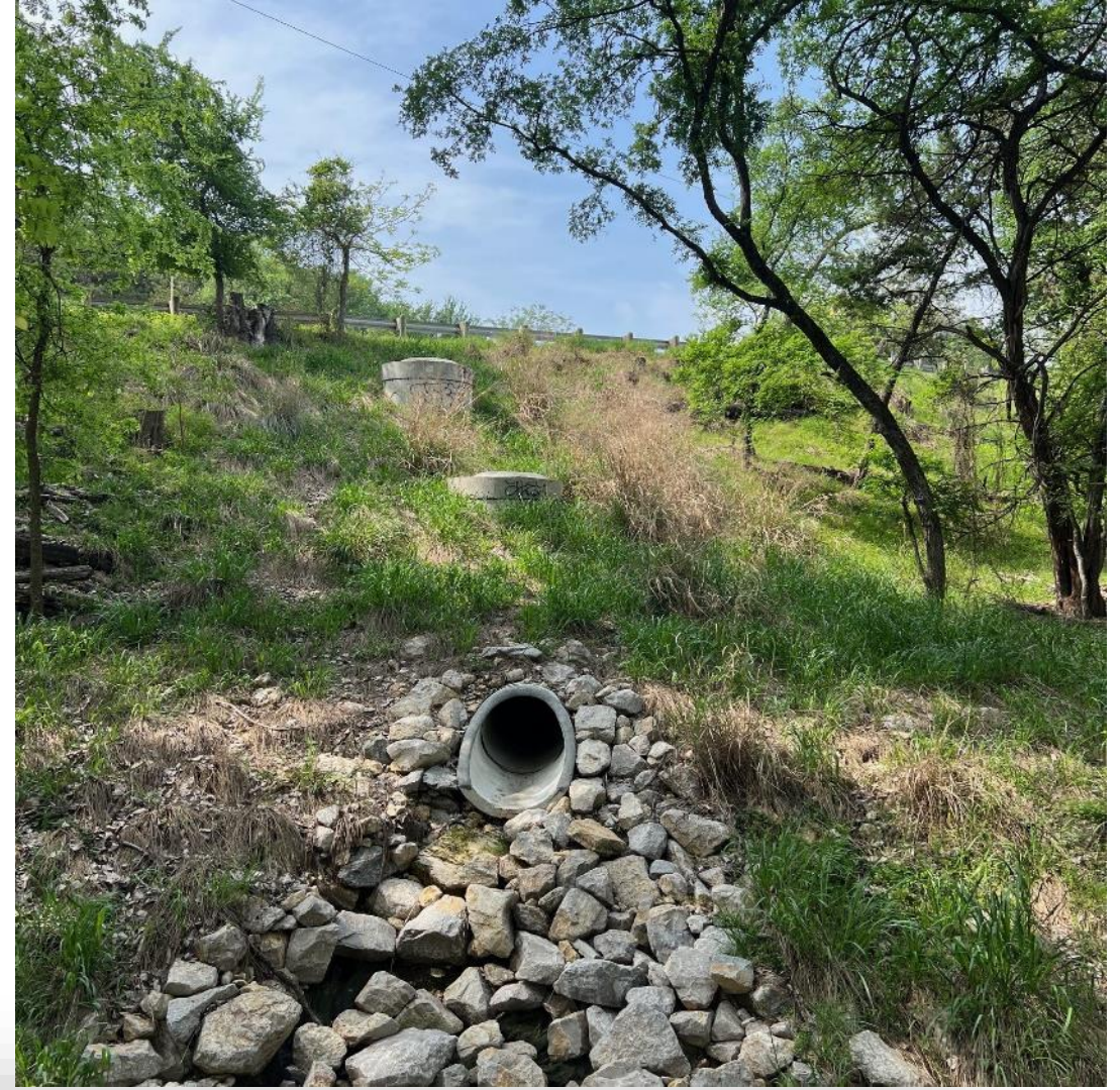
Sessom Creek, Ph 1 Project Photos Pre- & Post-Project